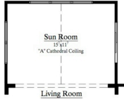
Sun Room Option