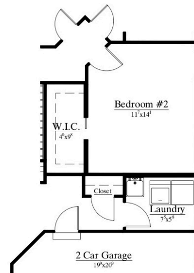
Optional Relocated Laundry