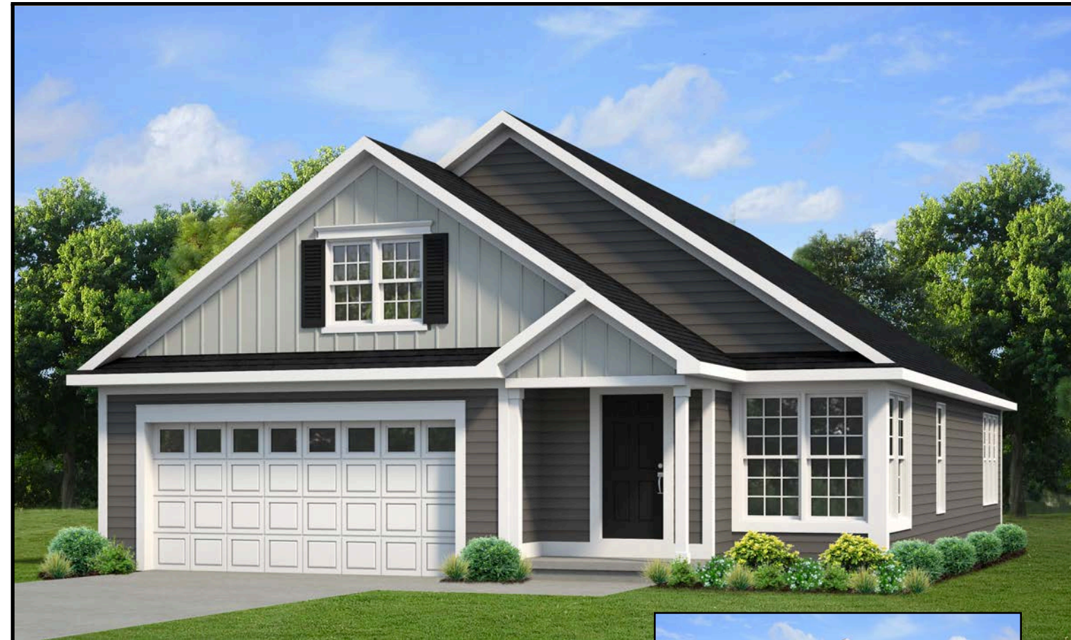
Optional elevation shown

While the information shown was correct when approved for printing, Marrano/Marc Equity Corporation reserves the right to discontinue or change at any time specifications or designs without incurring any obligations. Some features shown in models are optional at extra cost.