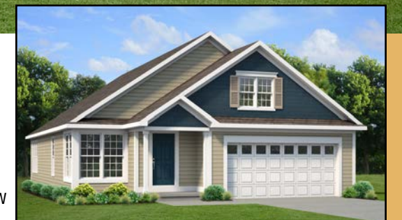
Optional elevation shown

Marrano Homes set the standard of excellence in the community and industry by providing a streamlined process for new home construction. We support local vendors and suppliers who provide superior workmanship, materials and products. Unique tools like Marrano's state-of-the-art Design Center and personalized interior design services help you with selections to make the home your own. With Marrano's Peace-of-Mind Warranty included with every home, you can be certain we're committed to exceeding your expectations and earning your trust in every aspect of the building process.