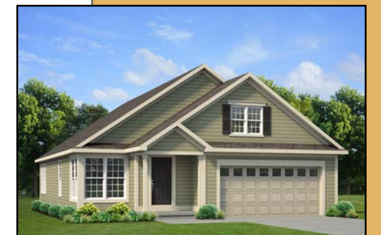
Optional elevation shown