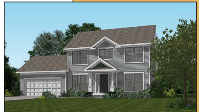
Optional elevation shown