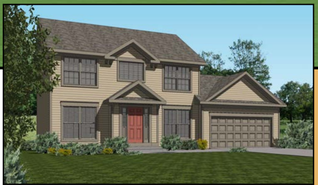
Optional elevation shown

Marrano Homes set the standard of excellence in the community and industry by providing a streamlined process for new home construction. We support local vendors and suppliers who provide superior workmanship, materials and products. Unique tools like Marrano's state-of-the-art Design Center and personalized interior design services help you with selections to make the home your own. With Marrano's Peace-of-Mind Warranty included with every home, you can be certain we're committed to exceeding your expectations and earning your trust in every aspect of the building process.