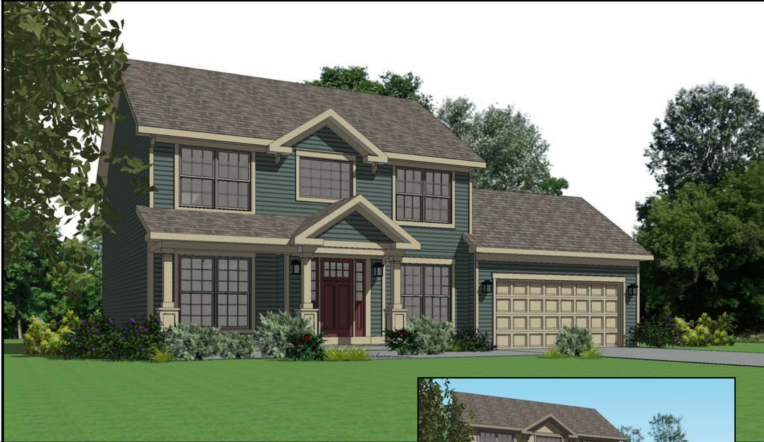
Optional elevation shown

1741 - 1850 + Sq. Ft. 3 Bedrooms - 2.5 Bathrooms