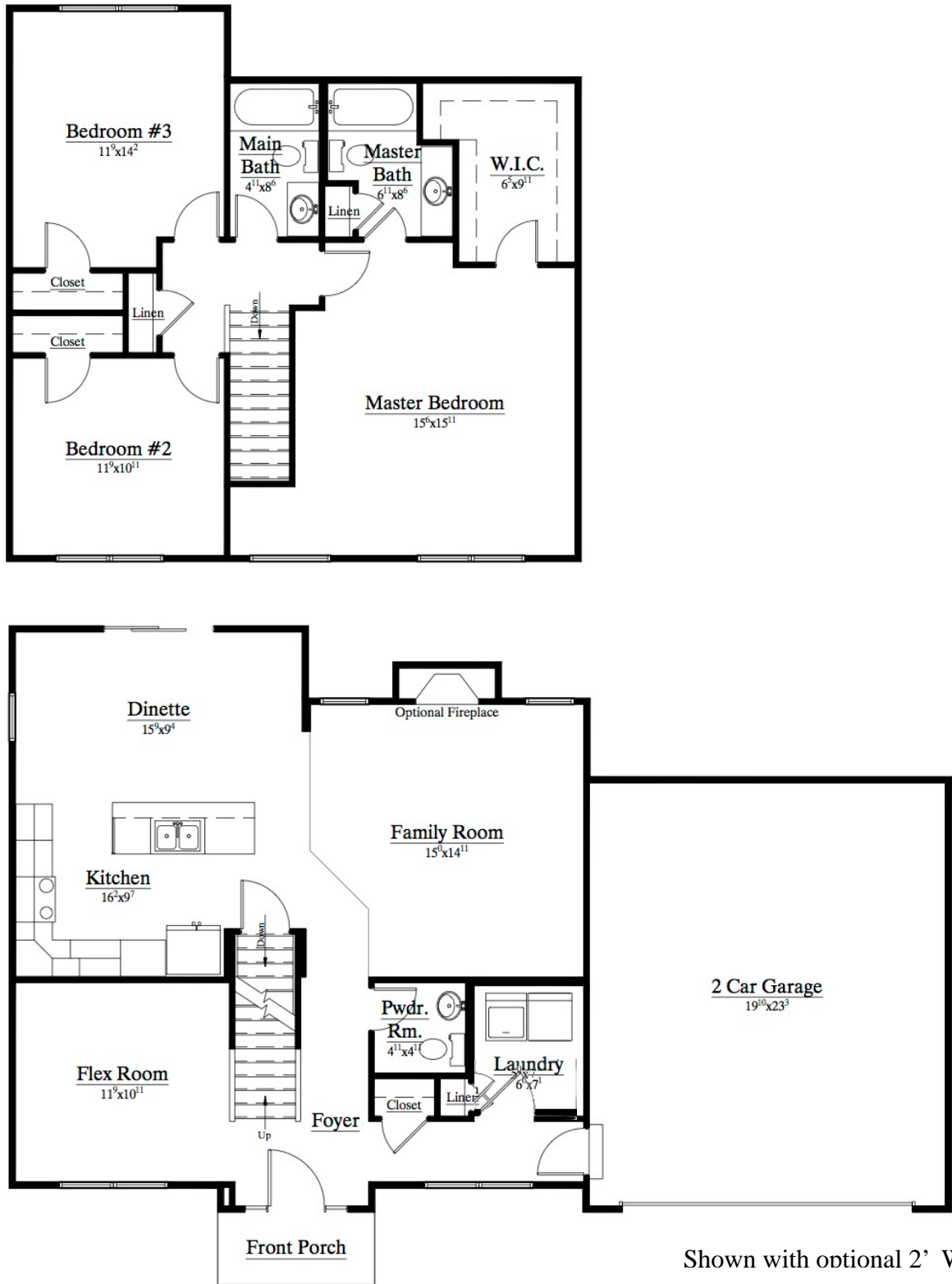
Shown with optional 2' Width Expansion

While the information shown was correct when approved for printing, Marrano/Marc Equity Corporation reserves the right to discontinue or change at any time specifications or designs without incurring any obligations. Some features shown in models are optional at extra cost.