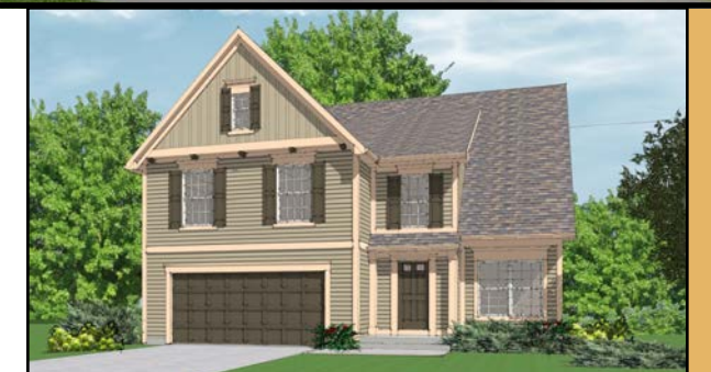
Optional elevation shown

Marrano homes set the standard of excellence in the community and industry by providing a streamlined process for new home construction. We support local vendors and suppliers who provide superior workmanship, materials and products. Unique tools like Marrano's state-of-the-art Design Center and personalized interior design services help you with selections to make the home your own. With Marrano's Peace-of-Mind Warranty included with every home, you can be certain we're committed to exceeding your expectations and earning your trust in every aspect of the building process.