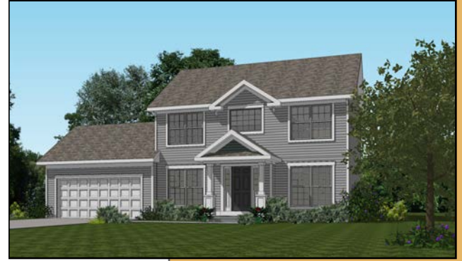
Optional elevation shown