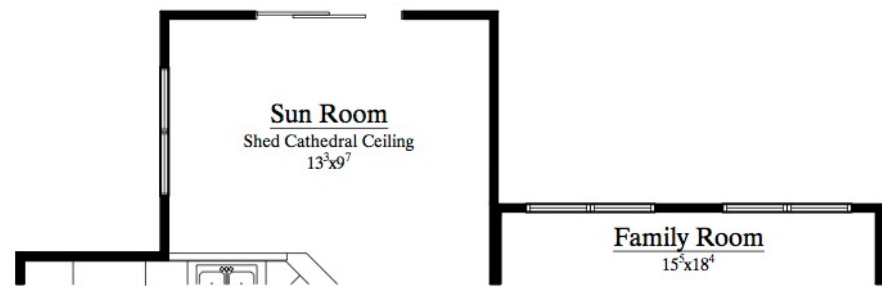
Optional 2' Family Room Expansion w/ Sun Room