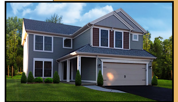
Optional elevation shown