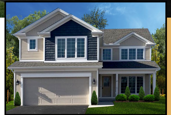
Colonial elevation Shown

Marrano homes set the standard of excellence in the community and industry by providing a streamlined process for new home construction. We support local vendors and suppliers who, in turn, provide superior workmanship, materials and products. Unique tools like Marrano's state-of-the-art Design Center and personalized interior design services help you with selections to make the home your own. With Marrano's Peace-of-Mind Warranty included with every home, you can be certain we're committed to exceeding your expectations and earning your trust in every aspect of the building process.