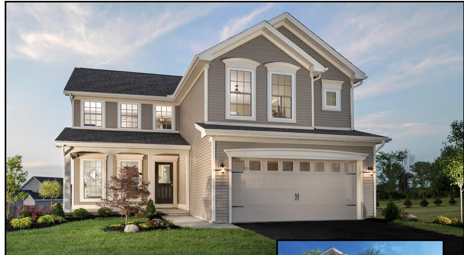
Optional elevation shown

While the information shown was correct when approved for printing, Marrano/Marc Equity Corporation reserves the right to discontinue or change at any time specifications or designs without incurring any obligations. Some features shown in models are optional at extra cost.