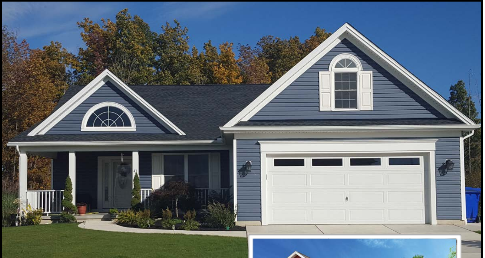
Optional elevation shown

1839 - 2000 Sq. Ft. + 2 or 3 Bedrooms - 2 Bathrooms