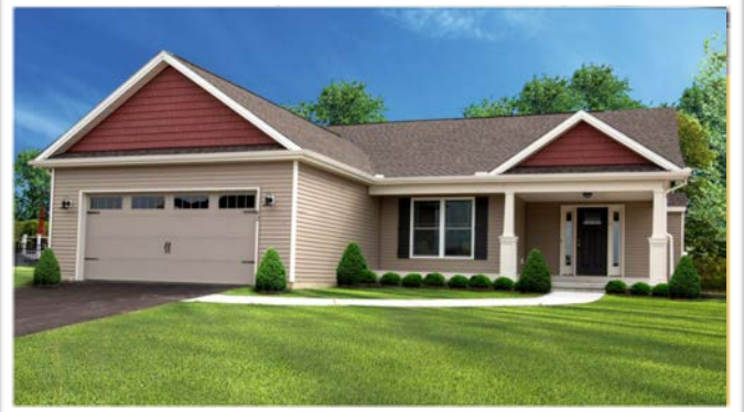
Optional elevation shown

Marrano homes set the standard of excellence in the community and industry by providing a streamlined process for new home construction. We support local vendors and suppliers who provide superior workmanship, materials and products. Unique tools like Marrano's state-of-the-art Design Center and personalized interior design services help you with selections to make the home your own. With Marrano's Peace-of-Mind Warranty included with every home, you can be certain we're committed to exceeding your expectations and earning your trust in every aspect of the building process.