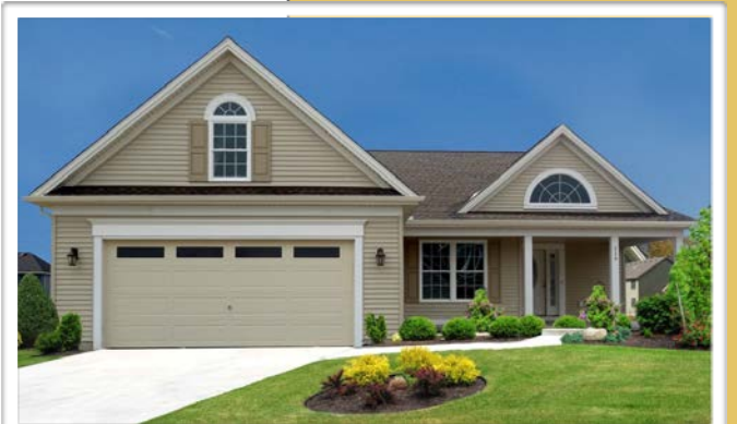
Optional elevation shown