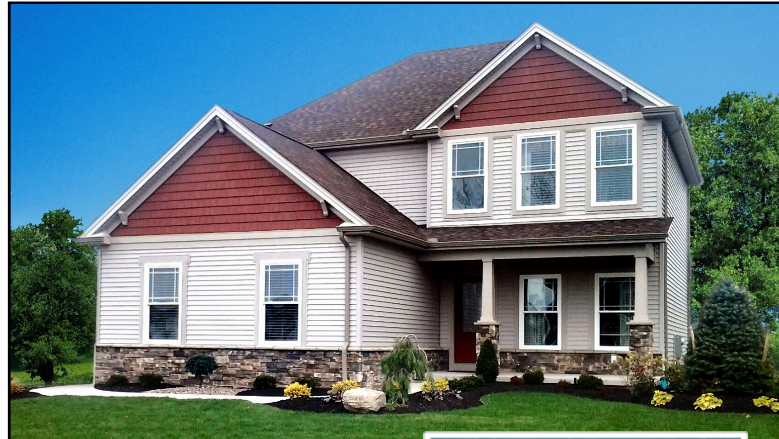
Optional elevation shown

While the information shown was correct when approved for printing, Marrano/Marc Equity Corporation reserves the right to discontinue or change at any time specifications or designs without incurring any obligations. Some features shown in models are optional at extra cost.