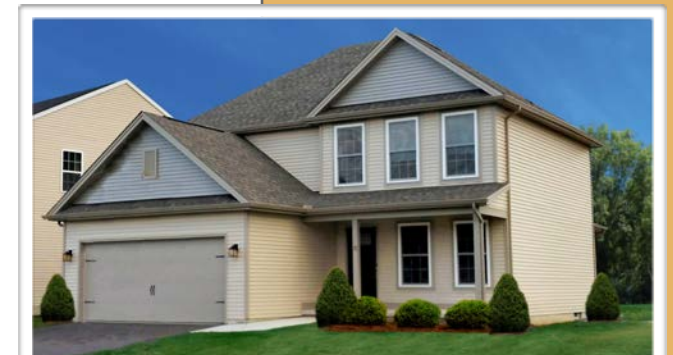
Optional elevation shown