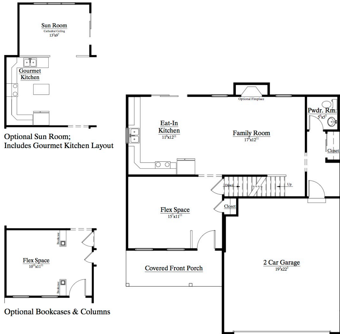
Optional Sun Room; Includes Gourmet Kitchen Layout