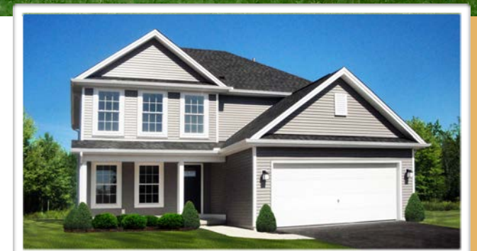
Optional elevation shown

Marrano homes set the standard of excellence in the community and industry by providing a streamlined process for new home construction. We support local vendors and suppliers who, in turn, provide superior workmanship, materials and products. Unique tools like Marrano's state-of-the-art Design Center and personalized interior design services help you with selections to make the home your own. With Marrano's Peace-of-Mind Warranty included with every home, you can be certain we're committed to exceeding your expectations and earning your trust in every aspect of the building process.