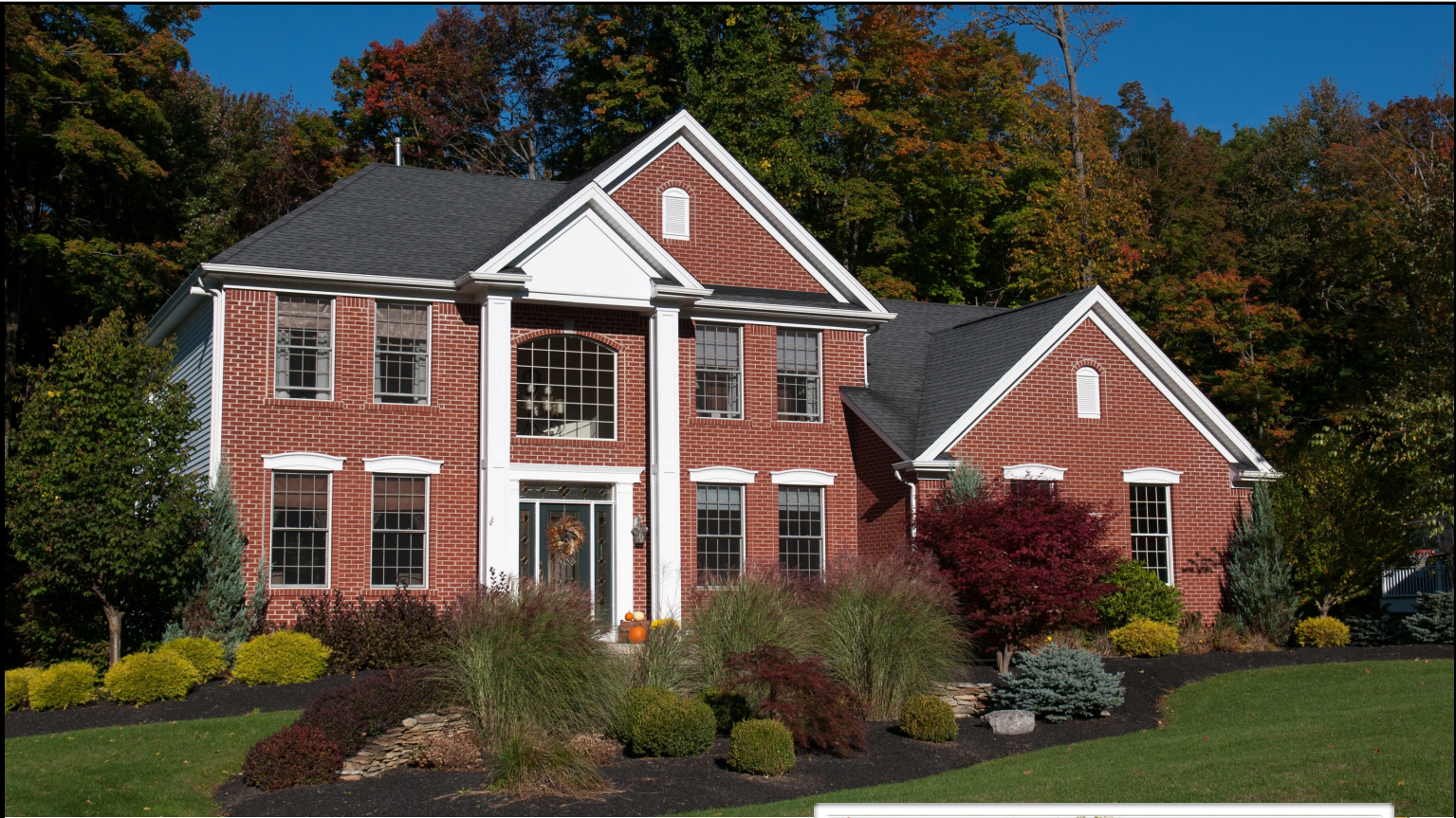
Optional elevation shown

2760 - 3400 + Sq. Ft. 4 Bedrooms - 2.5 Bathrooms