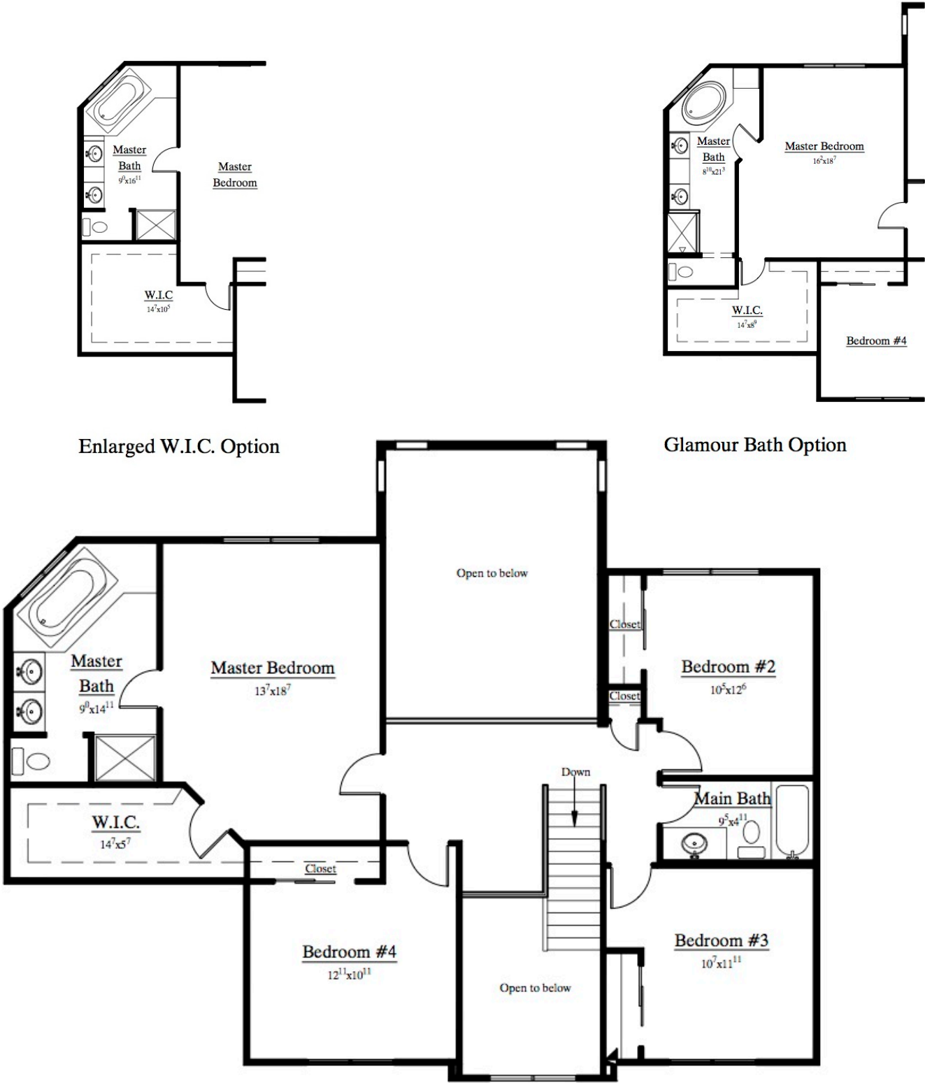
Enlarged W.I.C. Option