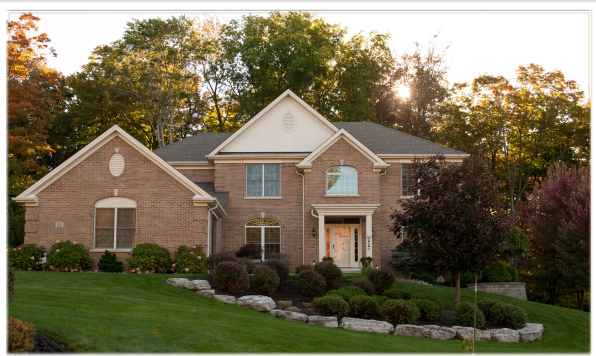
Optional elevation shown

Marrano Homes set the standard of excellence in the community and industry by providing a streamlined process for new home construction. We support local vendors and suppliers who provide superior workmanship, materials and products. Unique tools like Marrano's state-of-the-art Design Center and personalized interior design services help you with selections to make the home your own. With Marrano's Peace-of-Mind Warranty included with every home, you can be certain we're committed to exceeding your expectations and earning your trust in every aspect of the building process.