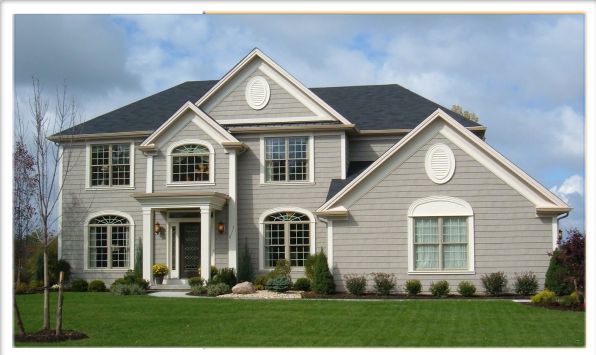
Optional elevation shown