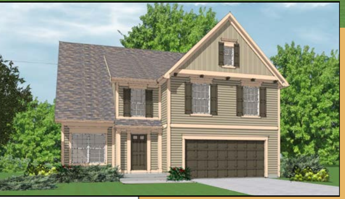
Optional elevation shown

Marrano homes set the standard of excellence in the community and industry by providing a streamlined process for new home construction. We support local vendors and suppliers who provide superior workmanship, materials and products. Unique tools like Marrano's state-of-the-art Design Center and personalized interior design services help you with selections to make the home your own. With Marrano's Peace-of-Mind Warranty included with every home, you can be certain we're committed to exceeding your expectations and earning your trust in every aspect of the building process.